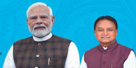
Shri Narendra Modi Prime Minister

Discover the new eastern powerhouse of growth – Utkarsh Odisha – Make in Odisha Conclave 2025 . With its rich heritage, skilled workforce, pro-industry policies and a favourable micro-climate. Join the bandwagon to be part of this unstoppable juggernaut of sustained economic boom.